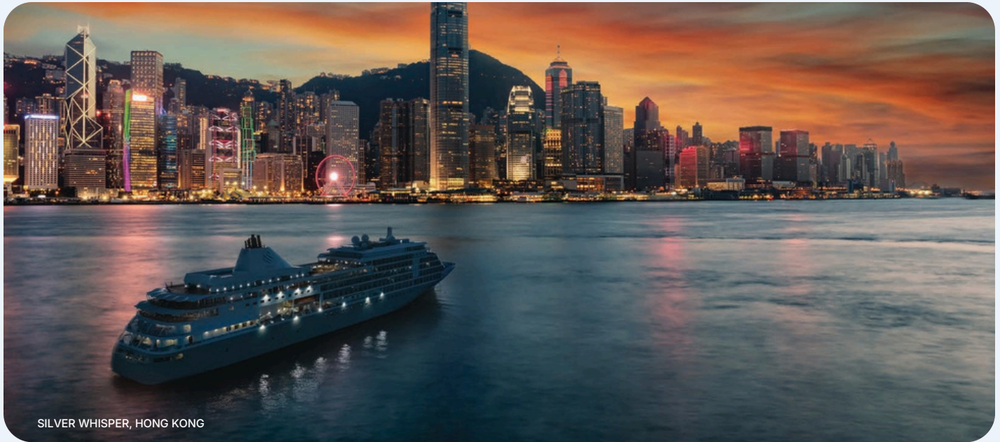
SILVER WHISPER, HONG KONG